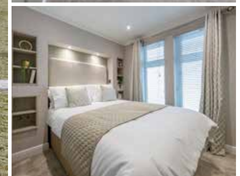
OMAR ANNIVERSARY PARK HOME